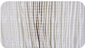
Up to 225 ft 2 of filtration area