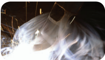
Highest performance motor for its category