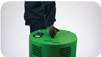
Portable and space-saving unit